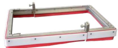
Splash and Dust Guard