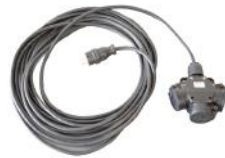
Red Shark Driver