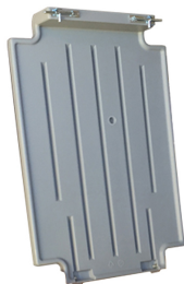
Lid for Carrytank 220

Retention basin for ground use, 100% tank's volume capacity, made in carbon steel.