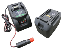
Manganese 12V battery with battery charger (cigarette lighter plug) and battery slot

Polyethylene covering Lid, integrated in the tank's structure and manufactured in rotational molding.