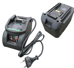
Manganese 12V battery with battery charger (European plug type C) and battery slot

For diesel and gasoline. Impurity filtration. Filter capacity 60µm. Flow rate 50 l/min.