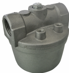
Strainer filter stainless steel

For diesel and gasoline. Impurity filtration. Filter capacity 60µm. Flow rate 50 l/min.