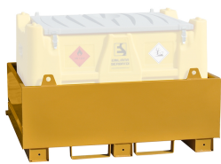
Retention Basin for Carrytank

Retention basin for ground use, 100% tank's volume capacity, made in carbon steel.