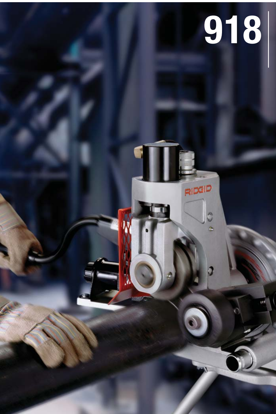
Stabilizer kit (59992) not included