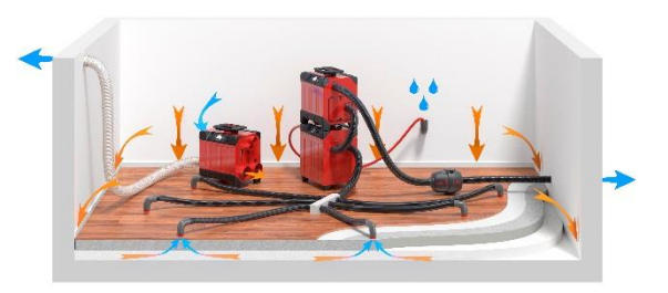
Suction drying. The dryer dries the ambient air and the turbine draws and evacuates air from the construction. The resulting underpressure in the construction draws dry air into it.

Before pressure drying is applied, suction drying shall be used to remove any free water from the construction and thus avoid pushing this into other parts of the building. The initial removal of free water also saves time.