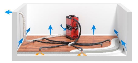
Pressure drying. The turbine is fed with dry air from the dehumidifier and presses this air into the layered construction.

Pressure drying might free particles/fibers from the construction and thus release them in the air. If this is a potential problem, another method should be applied.