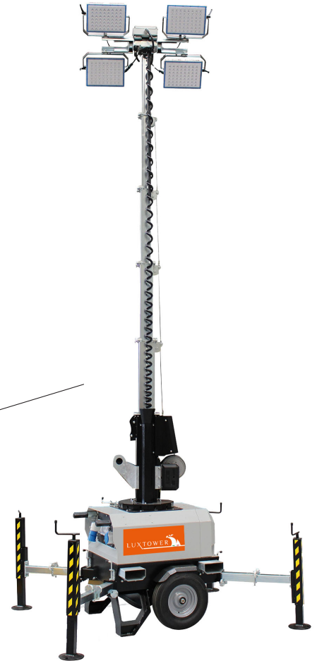
Finder twilight switch model 11.71.7.230.0000