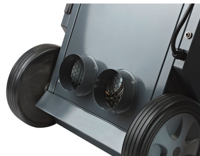
CDT 30 S and CDT 40 S are fitted with a 1 kW heating element, a high pressure fan and two duct spigots, allowing connection of two flexible air ducts Ø100, each up to 5 m long.

The mobile CDT dehumidifier can be supplied with a condensate pump cassette which is fitted instead of the water container. It pumps the condensate water to a drain. Using this condensate pump will enable your dehumidifier to run maintenance free, you will no longer have to empty a heavy reservoir filled with water. The lifting height is max. 4 m. The condensate pump cassette is available as accessory.