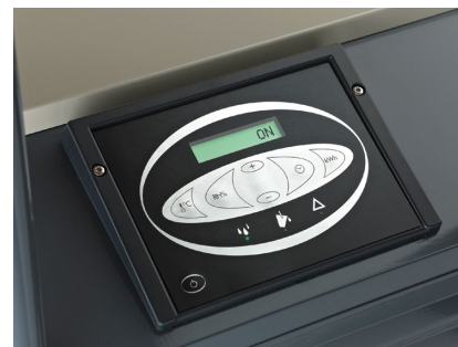
Digital display with integrated humidity control, energy counter, service status and easy fault finding allows optimal dehumidification.