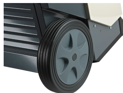
Big rubber wheels ensure safe and easy manoeuvring.

All units in the Dantherm CDT range are condensation dehumidifiers. An integral fan draws humid air into the dehumidifier and passes it through an evaporator. When the warm humid air meets the cold surface of the evaporator it condenses into water which is led to the water container. In the process the dry air is heated and returned to the room. The repeated circulation of air through the unit reduces the relative humidity, giving very rapid but gentle drying.