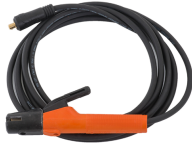
Welding cable 5 m 16 mm 2