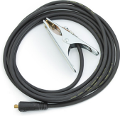
Earth return cable 5 m, 16 mm 2