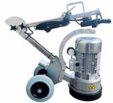
ALPHA foldable handle