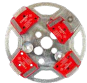
EASY CHANGE SYSTEM

Special tool for decoating - aggressive when removing coating systems (e.g. OS in car parks), cured or hard adhesives, etc. Long service life. Coarse grinding pattern but finer grinding pattern than PCD discs.