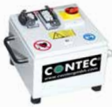
External control panel for ALPHA-S