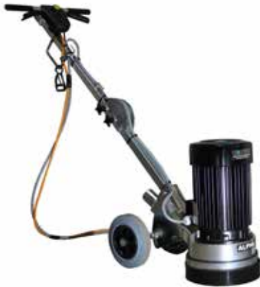
ALPHA - S with speed control