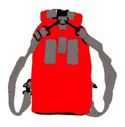
SMX1001 & SMX1003