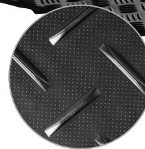
Diamond Cleat Surface Tread