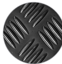
Low-Profile 4-Bar Surface Tread